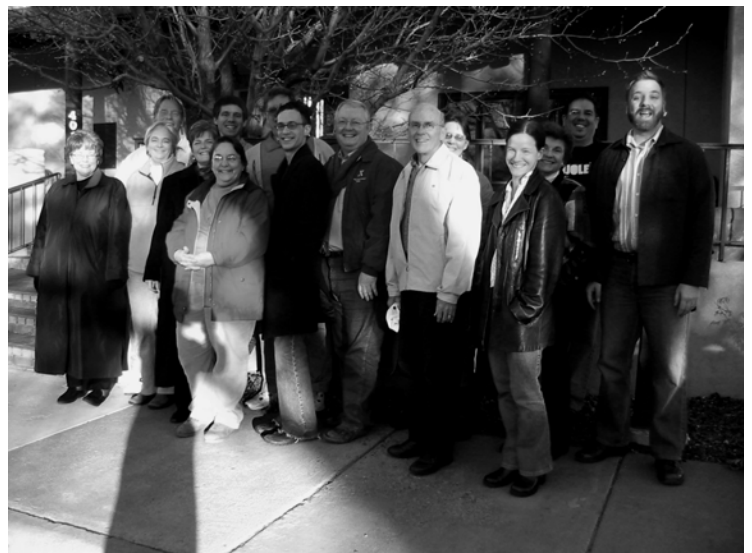
MLP National Board Members - Feb. 2006 Santa Fe Meeting